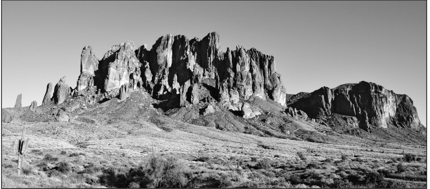
Superstition Mountain rises 3,000 feet high. It is a popular recreational destination for hikers and horseback riders.

Somewhere in Arizona's Superstition Mountains is said to be the Lost Dutchman Mine. The mine is named after Jacob Waltz. Waltz came to America in 1845. He was from Germany and spoke German, or Deutsch . People named him the "Dutchman."